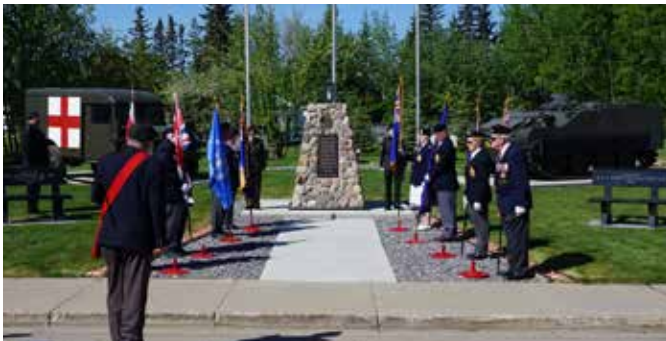
Wildwood RCL Branch #149 Veterans Park