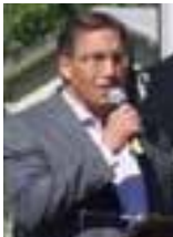
Parkland County Mayor Rod Shaigec