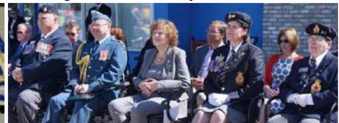
Dignitaries at Wildwood Legion Br. #149 Veterans Park Opening Ceremony - 6 May 2016