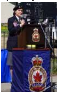
Originator of Veterans Park concept & Past President of Br. #149 RCL Wildwood - also Community Connector Committee Member