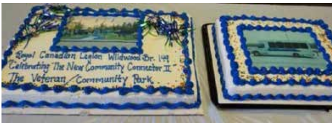
Cakes served after lunch served in the Legion following Opening Ceremony Opening Veterans Park Wildwood & New CC Bus