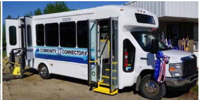
Presenting the new Community Connector II Handibus