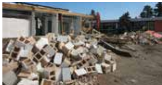
The school's cinder block walls come down.