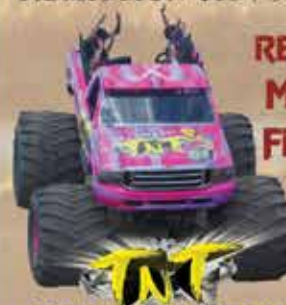
MONSTER RIDE TRUCK

Sunday, August 14 th , 2016 DOORS AT 11:30AM SHOW AT 1:00 PM ADMISSION $15 | 5 AND UNDER FREE