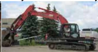
Canada's flag is respectfully brought down first.