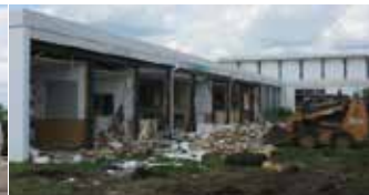
Window walls are removed.