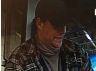
Submitted by Thorsby/ Breton RCMP

File # 2017-395118: On Friday, March 31 st at approximately 12 Noon a hit and run collision occurred in the parking lot of Teddy Bear's Restaurant in Alsike, AB.