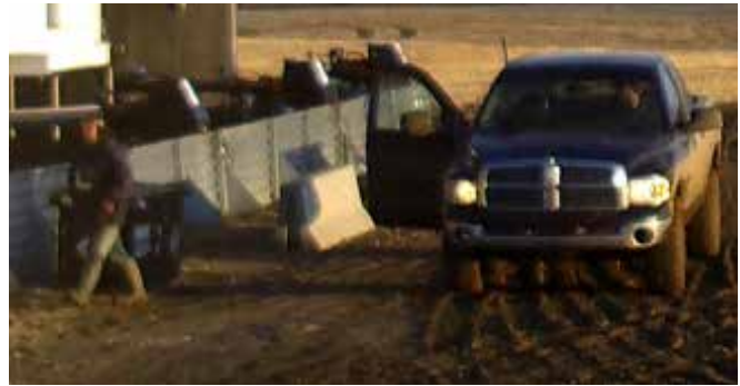
Submitted by Thorsby/ Breton RCMP