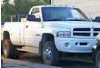
Submitted by Thorsby/Breton RCMP

Thorsby/Breton RCMP had a busy weekend responding to property crimes in the area.