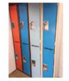
Wabamun School (K-9) Always Positive Always Learning