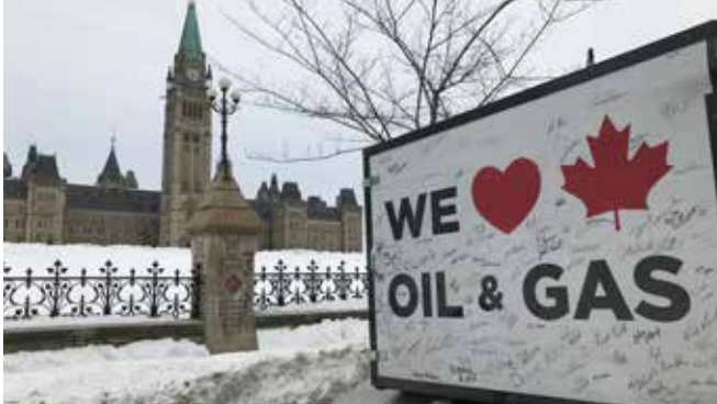
Submitted by Jim Eglinski, MP – Yellowhead