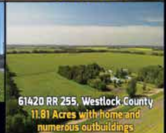
61420 RR 255, Westlock County 11.81 Acres with home and numerous outbuildings

Do not miss this opportunity to purchase one, two, or all three bare commercial lots ready to be built on in the heart of the Town of Redwater.