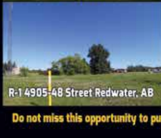
R-1 4905-48 Street Redwater, AB