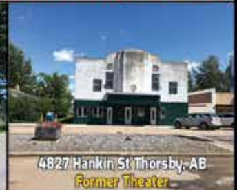
4827 Hankin St Thorsby, AB Former Theater