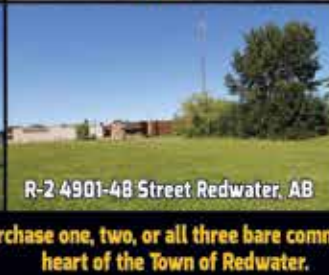
R-2 4901-48 Street Redwater, AB