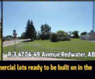
R-3 4704-49 Avenue Redwater, AB