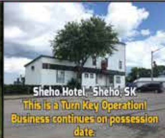
Sheho Hotel, Sheho, SK This is a Turn Key Operation! Business continues on possession date.