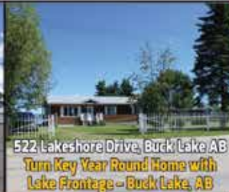
522 Lakeshore Drive, Buck Lake AB Turn Key Year Round Home with Lake Frontage – Buck Lake, AB