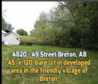
4820 - 49 Street Breton, AB 45' x 120' bare lot in developed area in the friendly village of Breton.

BIDDING OPENS: 10 AM – THU, SEP 17 BIDS START CLOSING: 3 PM – MON, SEPT 21