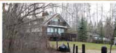
4 season cottage just steps from walking trails, grassed beaches, and common dock Ross Haven $354,900