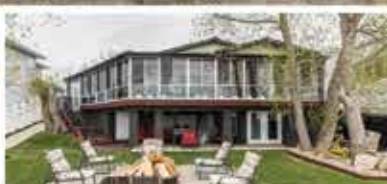
Recreation Focused Lower Level Campfires, Stars & Lake Life Yellowstone $729,900