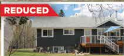
REDUCED Lake Life Comfort & Charm Great Home, Garage & Yard Lessard Lake Estates $454,900