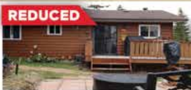
REDUCED Great Cottage vibes on generous Lot! Enjoy sheltering trees providing privacy Ross Haven $269,900