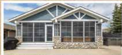
Estates at Water Edge Lake Front! 24X30 SHOP, Storge lot, 22X30 heated DBL Garage $698,900