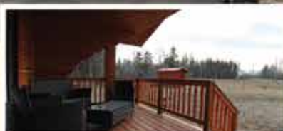
Stacked TIMBERBLOCK with Great Cottage Vibe Lessard Landing $269,900