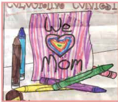
Charlie Age 5