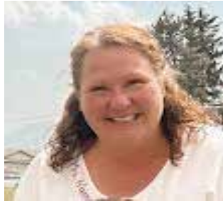
Principal, Wildwood School

As animals and the outdoors are a huge part of her family's lives, she can usually be found at the barn with her family and her horses if not at the school.