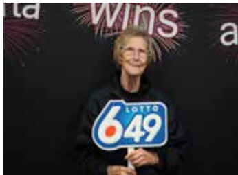
Submitted by Western Canada Lottery Corporation