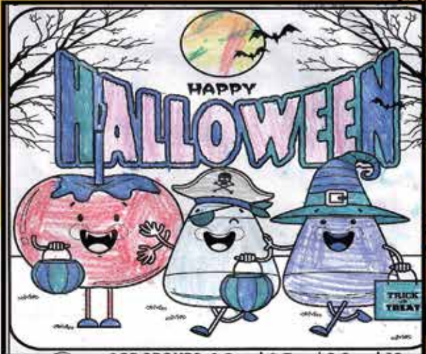
Bethany Age 6