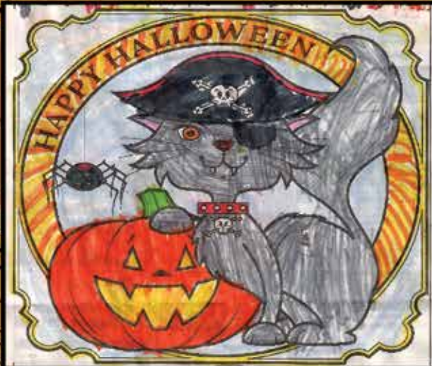
Meredith. Age 5