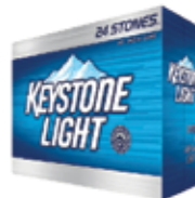
KEYSTONE LIGHT 24PK $28.49