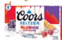
COORS SELTZER SLUSHIE MIXER 24PK CANS $42.99