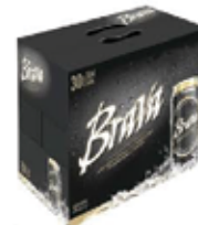
BRAVA 30PK CANS $38.99