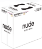
NUDE SODA MIXER 12PK CANS $23.99