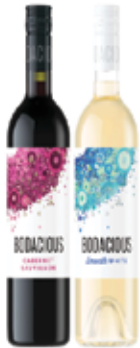
BODACIOUS SMOOTH RED AND WHITE 750ML $7.99