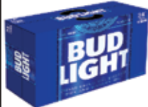
BUDWEISER, BUD LIGHT 24PK CANS $39.99