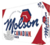
COORS LIGHT, CANADIAN 24PK CANS $39.99