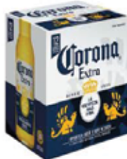
CORONA EXTRA 12PK BTLS $26.99