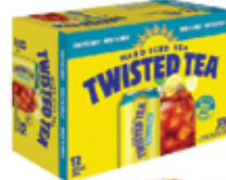
TWISTED TEA HARD ICED TEA & HALF AND HALF 12PK CANS $22.99