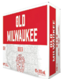
OLD MILWAUKEE 15PK CANS $21.99