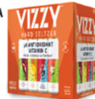
VIZZY MIXER 12PK CANS $22.99