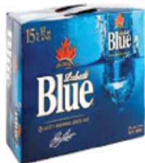
BLUE 15 CANS $18.99