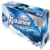
KOKANEE 18PK CANS $26.99