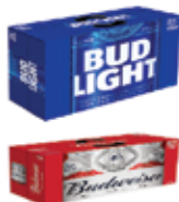
BUDWEISER, BUD LIGHT 24PK CANS $39.99