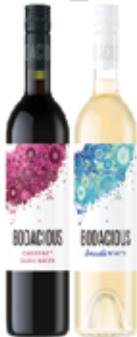
BODACIOUS SMOOTH RED AND WHITE 750ML $7.99