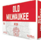
OLD MILWAUKEE 15PK CANS $21.99