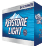
KEYSTONE LIGHT 24PK $28.49