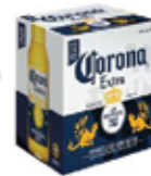
CORONA EXTRA 12PK BTLs $26.99