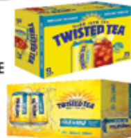
TWISTED TEA HARD ICED TEA & HALF AND HALF 12PK CANS $22.99