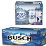
BUSCH LAGER & LIGHT 30PK CANS $40.99