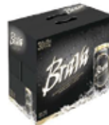
BRAVA 30PK CANS $38.99