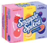
SNAPPLE VARIETY PACK 12 CANS $21.99