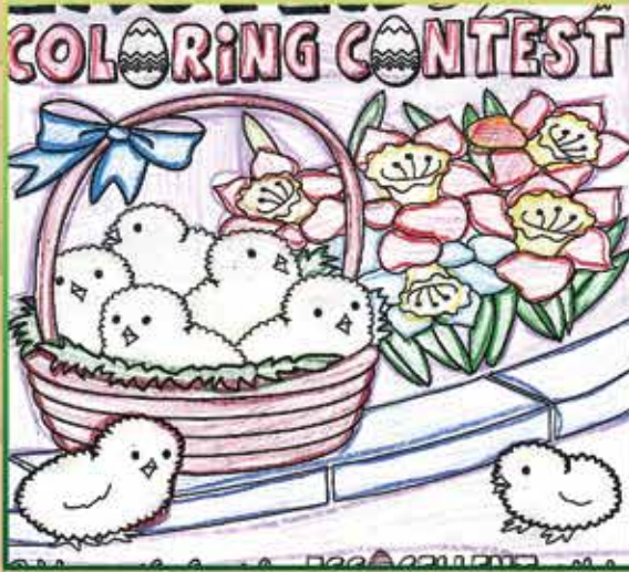
Brooklyn Age 2