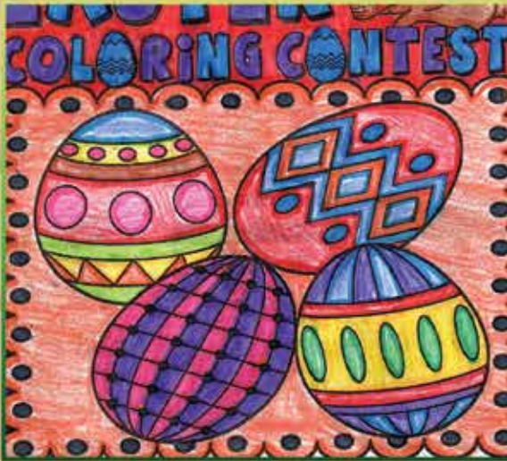
Silas Age 8