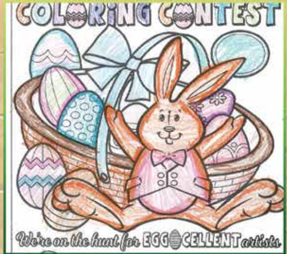
Saphira Age 6